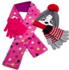
Hats, Gloves & Scarves

Operation Christmas Child suggested Gifts for January.....never to early to start ♥